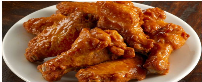
Wings 1lb. 19.95 Naked, Cajun, Dill Pickle, Salt & Pepper, BBQ, Mild, Hot, Honey Garlic, Maple Bacon, Teriyaki, Sweet Chili, Buffalo, Creamy Buffalo, Sweet & Sour, Lemon Pepper, with Veggies & Ranch dip