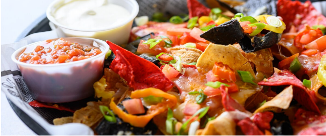
El Lobo Nachos 15.95 Tri color tortilla chips loaded with Nacho cheese, green onion, peppers, diced tomato, pickled jalapenos, sliced black olives served with salsa & sour cream